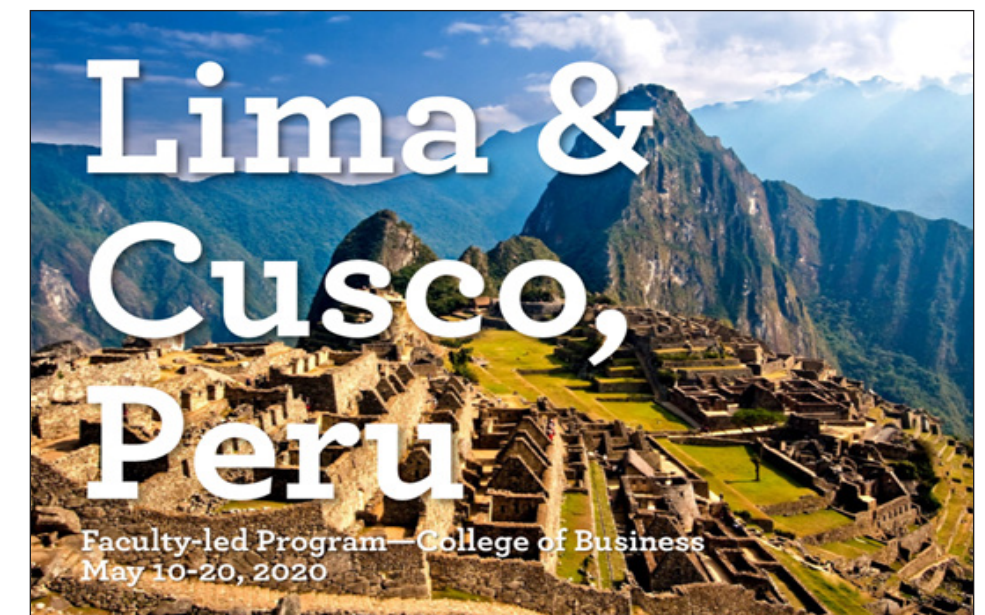
Study abroad poster for Peru