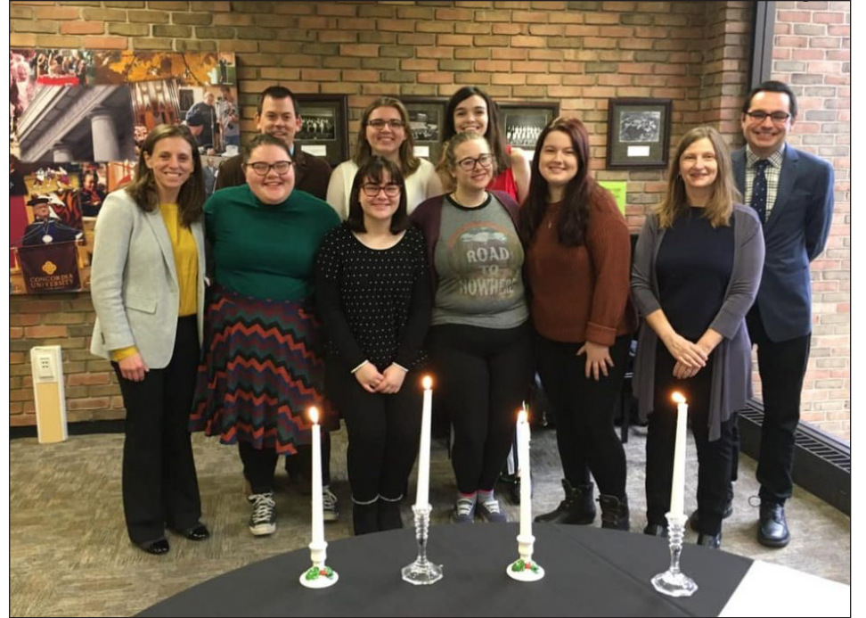
Some of the newly inducted CUC members of Lambda Pi Eta honor society.